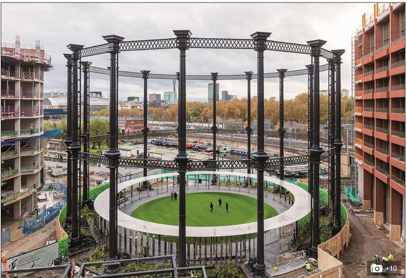
Gasholder Park is a new green space in the heart of King's Cross – a circular lawn that sits inside the carefully restored frame of a Grade II Victorian gasholder, Gasholder No8